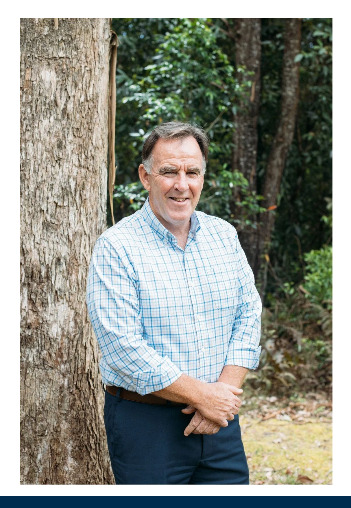
State of Affordable Housing on the Central Coast Report